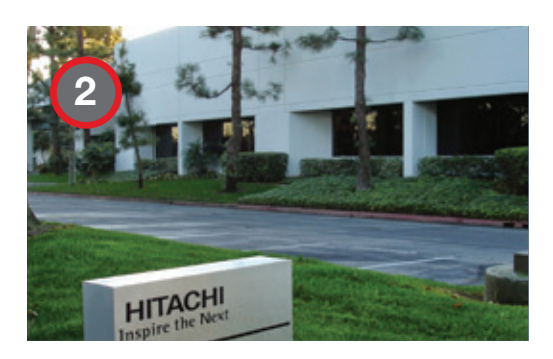
Cypress, California Office OES Sales, Aftermarket Sales, and Marketing.

Engine Control Units, CVT/4WD Control Units, Air Flow Sensors, Electronic Throttle Bodies, HEV/EV Systems, and Direct Injection Systems.